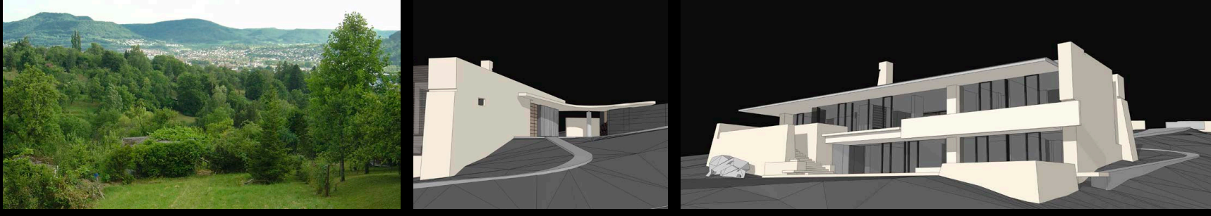
The plans are all done. Just after the summer holidays the construction work for "Fineway House" will start on this beautiful site. The house will be built in shiny refined concrete with the local limestone as aggregate.