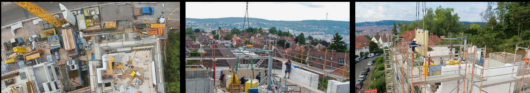
House PR41 has already reached its final height, the Parler Research House 39 is now more and more catching-up.

After intense researches on the book market we found this monograph we would like to recommend :-)