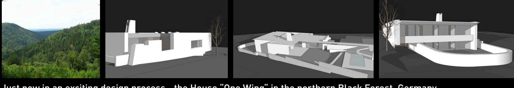
Just now in an exciting design process - the House "One Wing" in the northern Black Forest, Germany