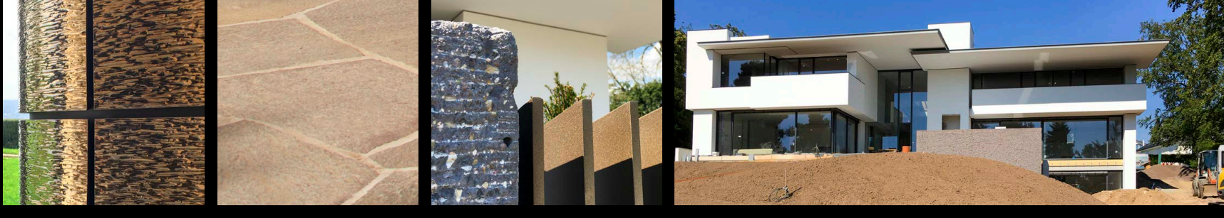
Crown House, Frankfurt - More and more beautiful and exciting materials and finishes are added. The Landscape is prepared for the laying of the turf rolls next week and like always this will change everything :-)