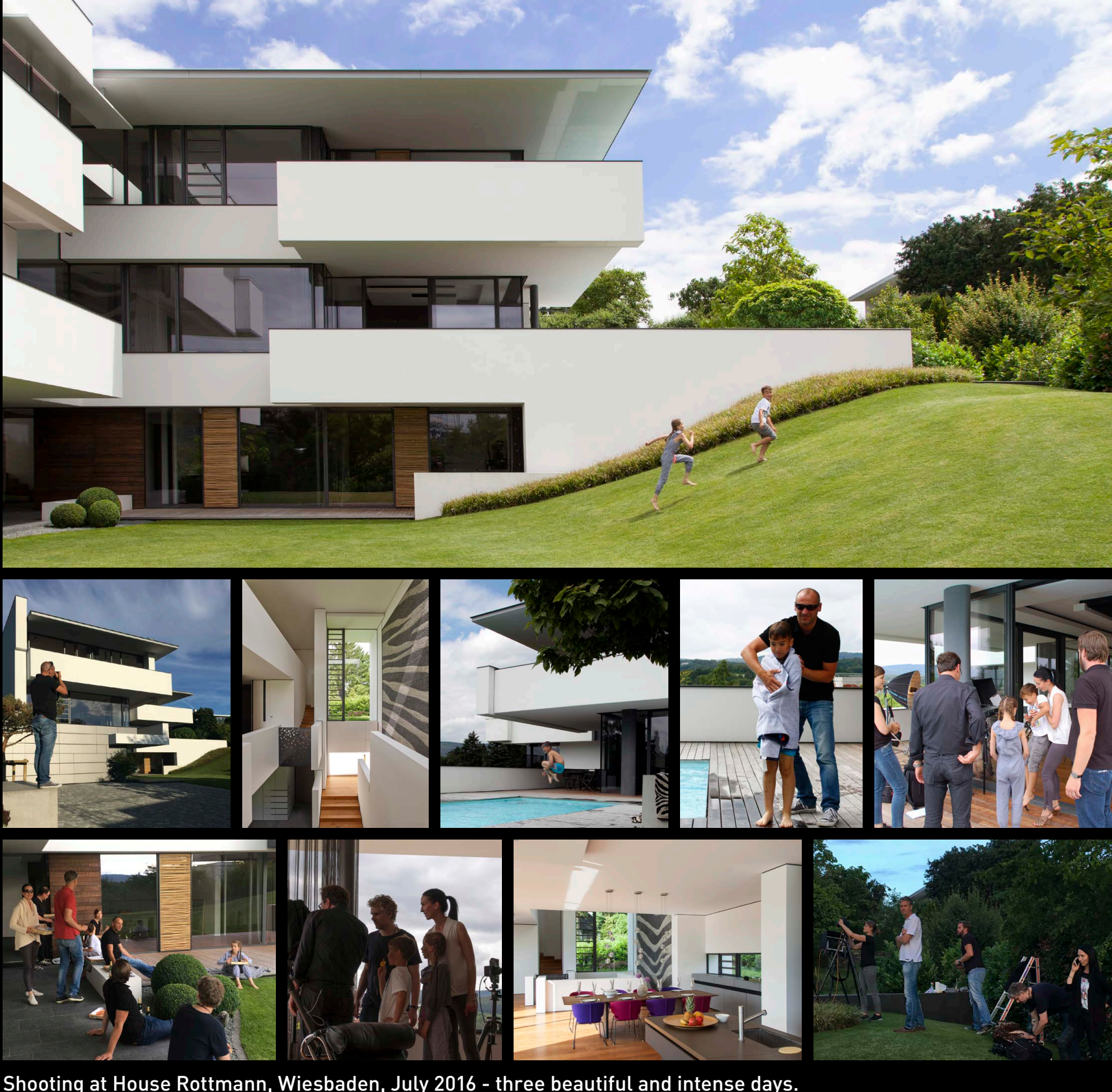
Shooting at House Rottmann, Wiesbaden, July 2016 - three beautiful and intense days. We are grateful for the warm welcome by our clients at their home and their support and acting as "real models". ... and very special thanks to their fantastic kids!