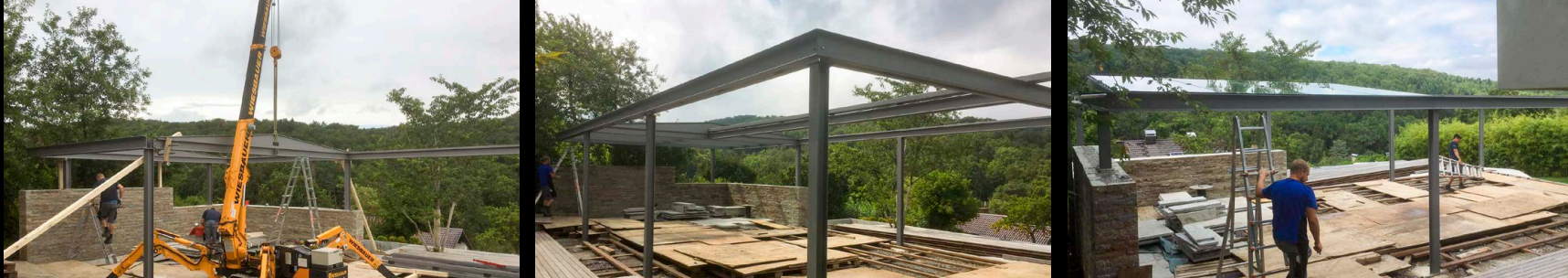
Ten years after we finished House B-Wald we designed a garden pavilion with an outdoor kitchen. This will be the right place for the small and large festivities of life.