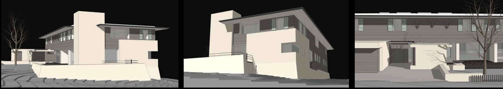
Design process finished for our first "real" country house in the mountains of Austria. The construction of stone and wood is inspired by the ancient traditional Montafon-houses.